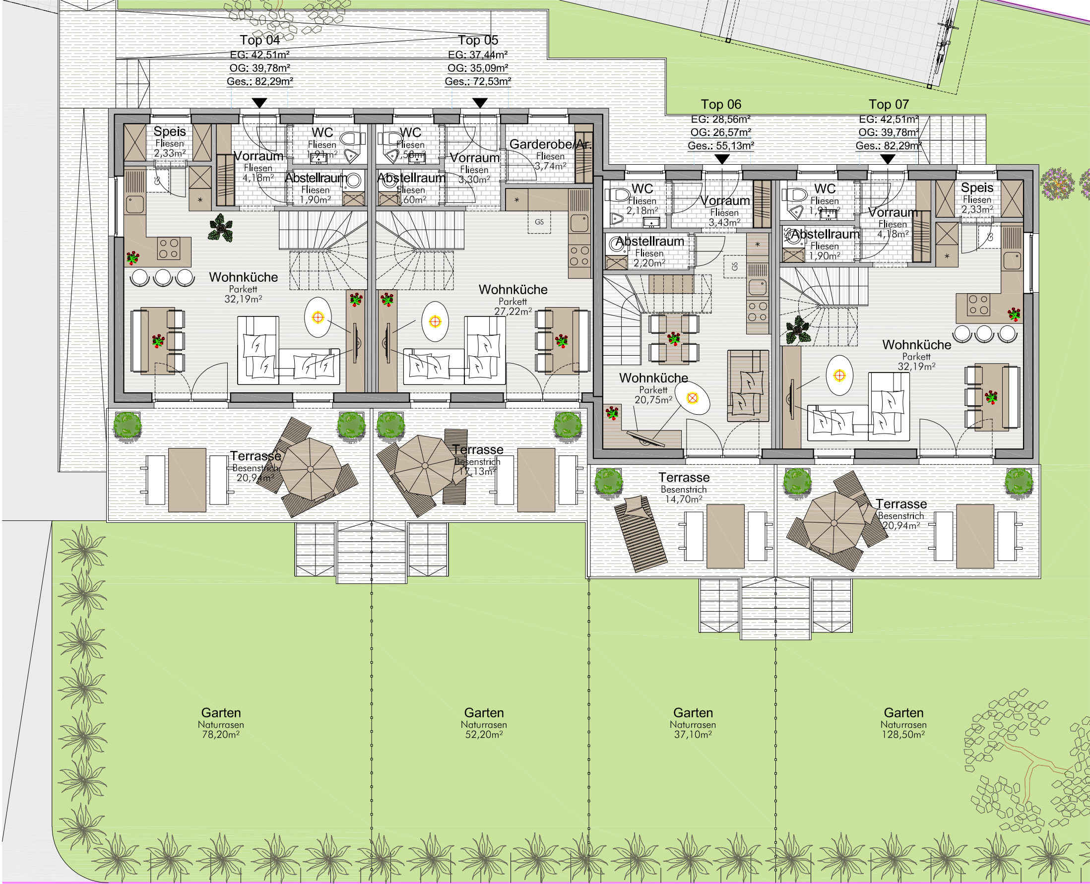
Haus 2 EG Top 4 - 7